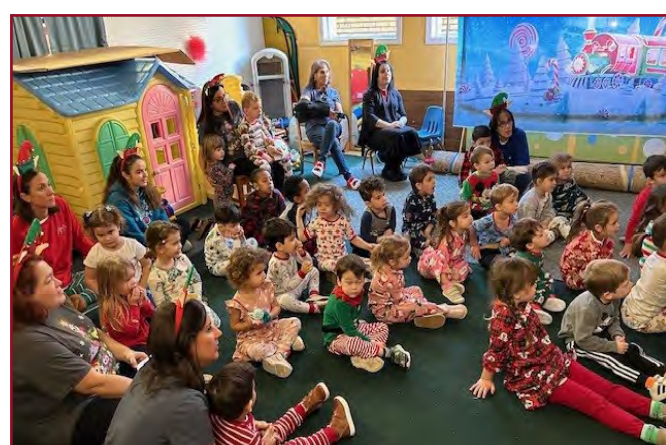
Christmas 2023 PJ Day and Polar Express Storytime MW 2, 3, 4 (2).