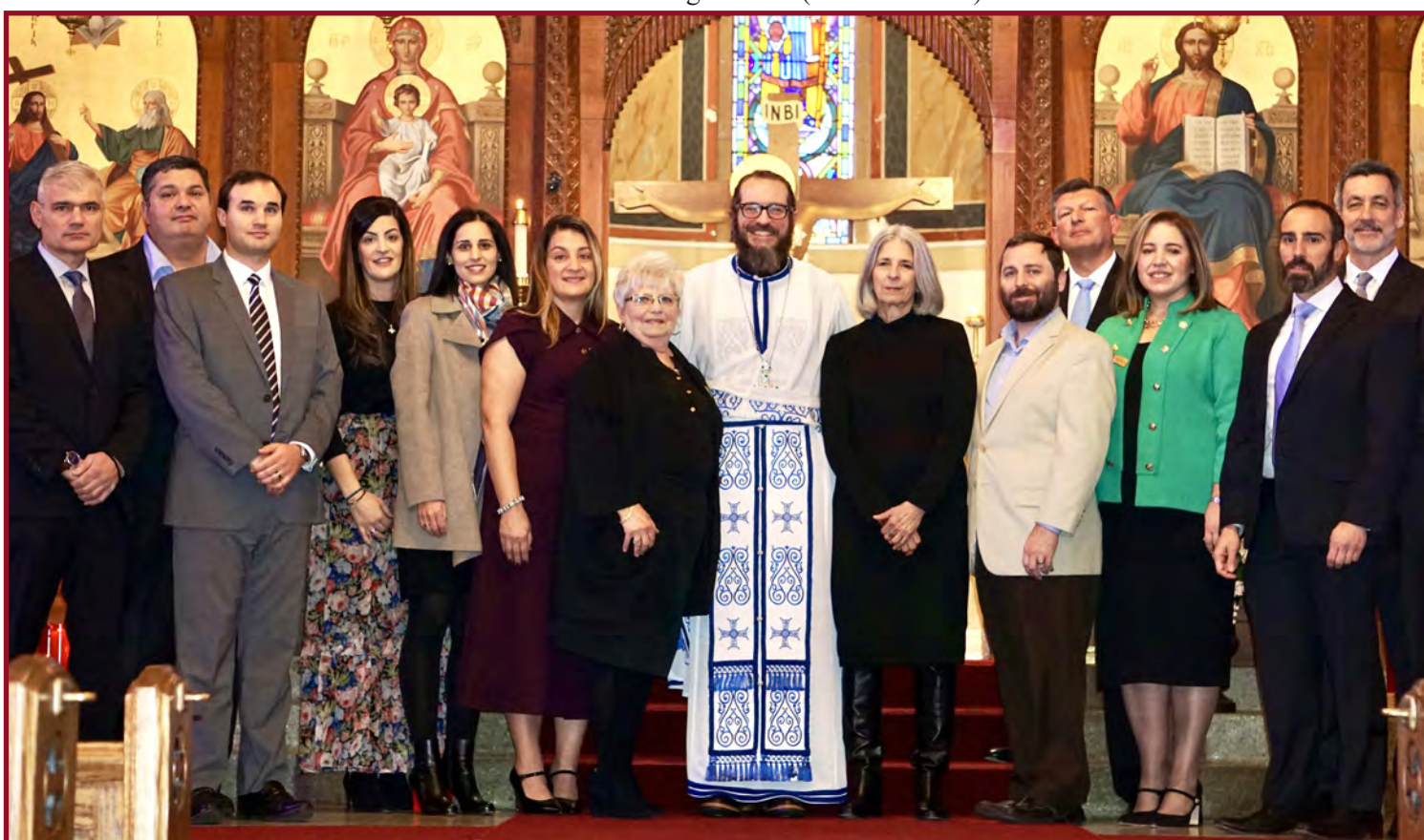
Swearing in of the Parish Council