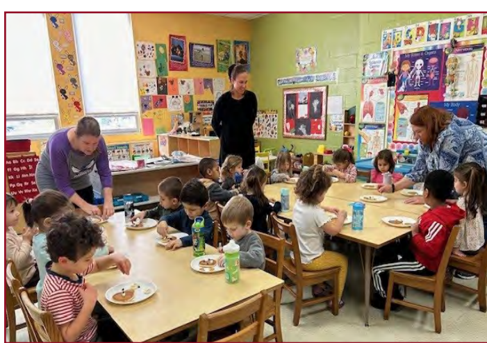
February 2024 Ground Hog Day 2024 Pancake Snack.