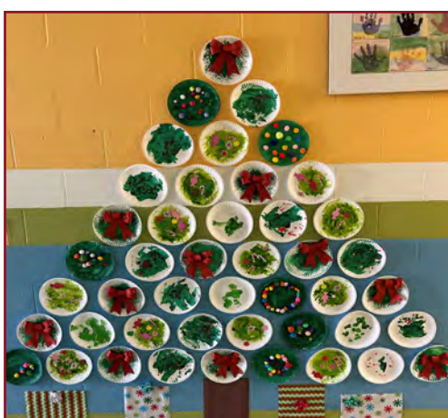
Christmas 2023 Paper Plate Christmas Tree.