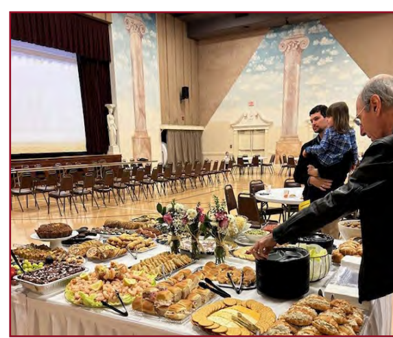
Preschool sponsored Coffee Hour/Brunch for the Parish General Assembly