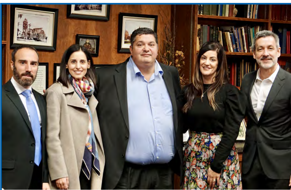
Parish Council Executive Board