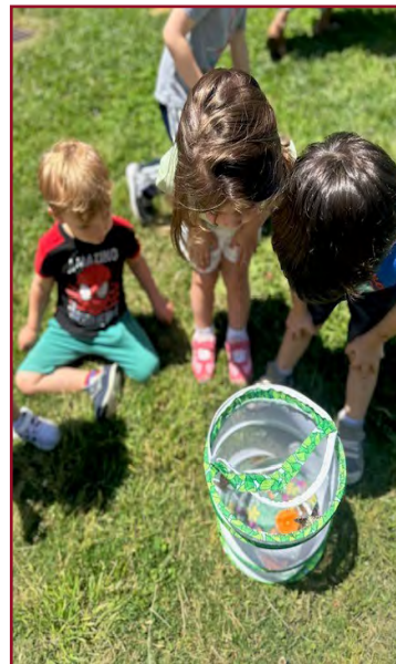
April 2024 Butterflies Released Life Cycle of a Butterfly – The children watched the caterpillars turn into butterflies before releasing them- 3's class