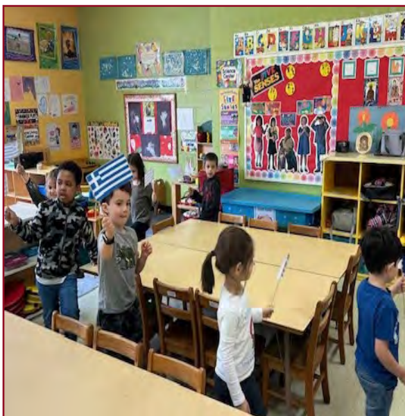
March 25th, 2024 and the Annunciation Celebration – 4's Class Greek Independence Day