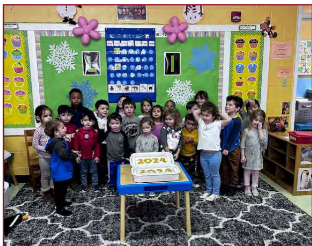
January 2024. Preschool Vasilopita – TTH 2's and 4's Classes