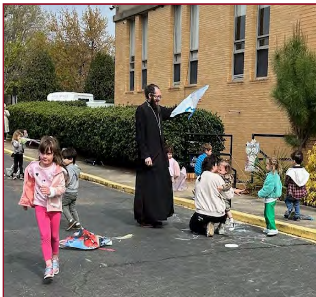
March 2024 First Day of Lent and Kite Flying Day