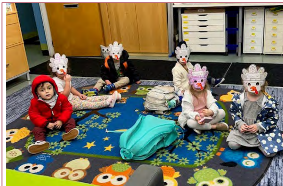
November 2023 Thanksgiving Turkey Masks – TTH 2's Class

The Preschool was very busy through the months of November to April. In addition to the academic aspects of preschool, the children had lots of fun celebrations and activities during that time. We hope you enjoy the pictures as much as we enjoyed watching the children learn and experience fun, faith and fellowship as a Preschool family.