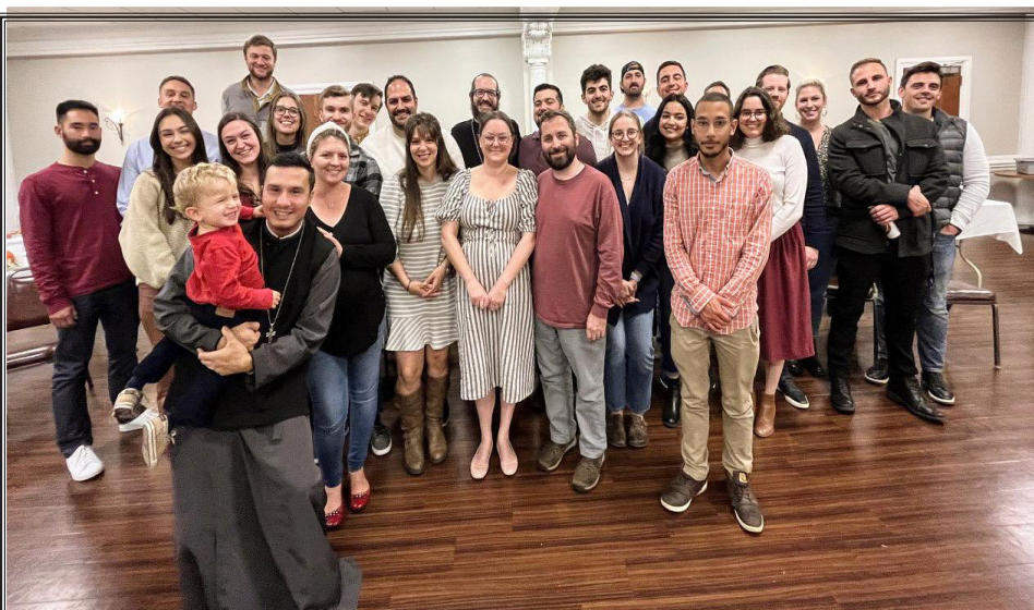
Orthodox Forum (21+)