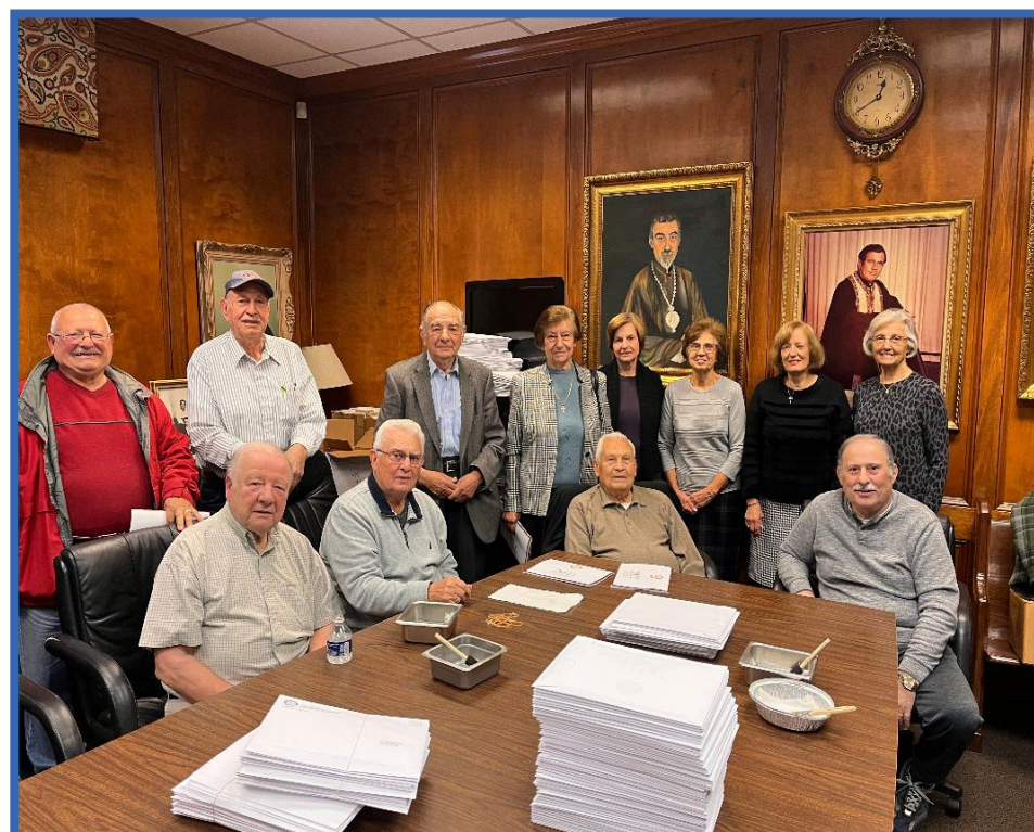
Holy Trinity Cathedral's Mailing Crew