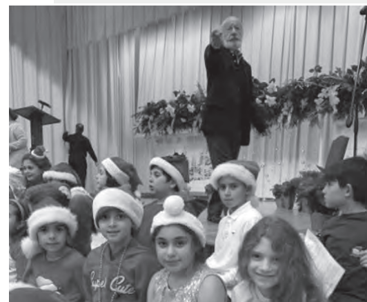
Στιγμιότυπα από τη χαρούμενη Χριστουγεννιάτικη γιορτή των μαθητών του Ελληνικού Σχολείου του Καθεδρικού Ναού Αγίας Τριάδος