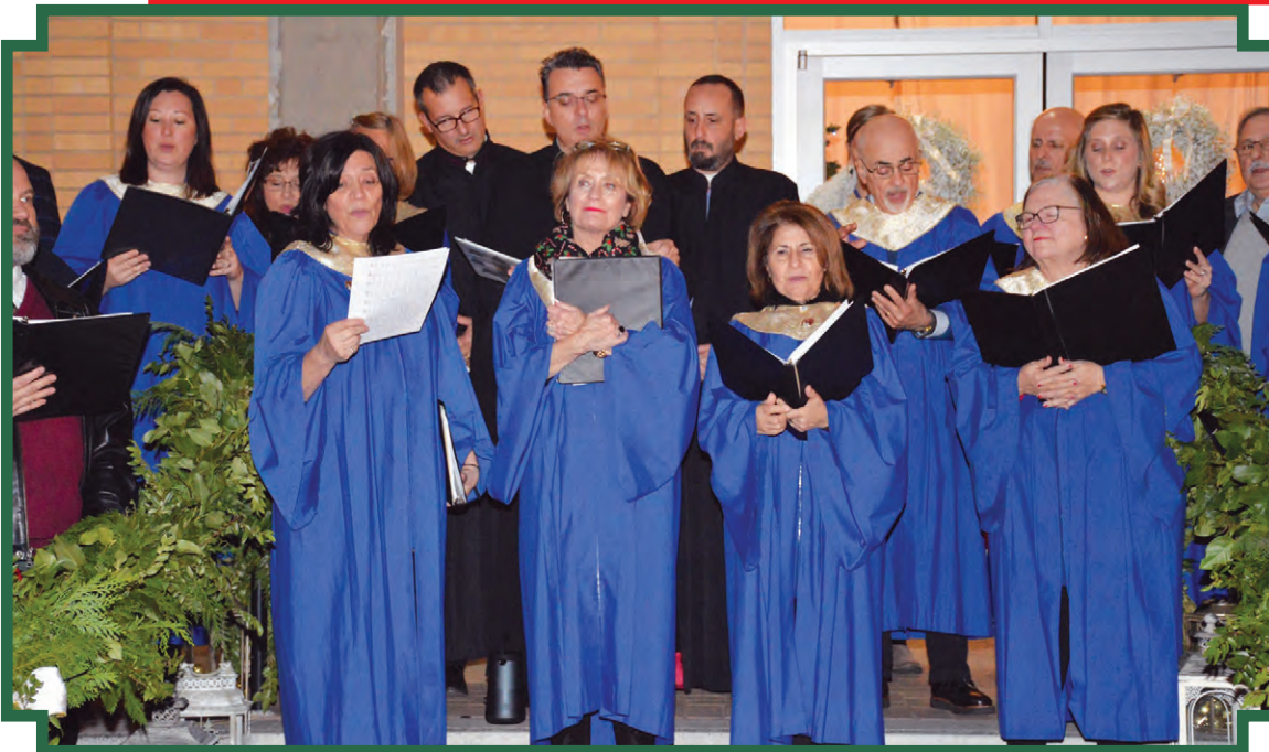
Above: Sunday School Christmas Pageant in the Cathedral ; Left: Choir performs at the Holy Trinity and Dilworth Community Christmas Concert and Tree Lighting ; Below: YAM party of colorful Christmas sweaters.