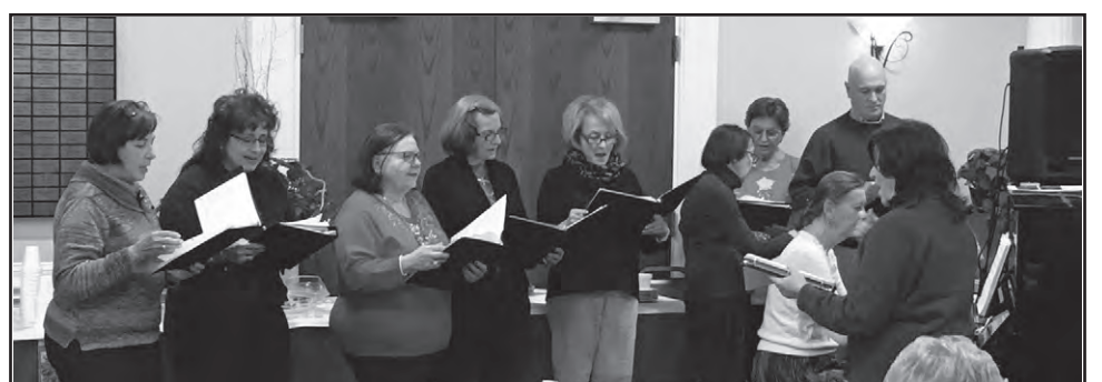
December 19, 2019: Members of the choir performing at the Forever Young dinner.

The Holy Trinity Church Musicians wish the entire community a very Merry Christmas and a happy and healthy New Year!