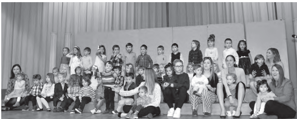
November 3, 2019: The Preschoolers perform at Yiayia's Kouzina, the preschool's annual fundraising luncheon.