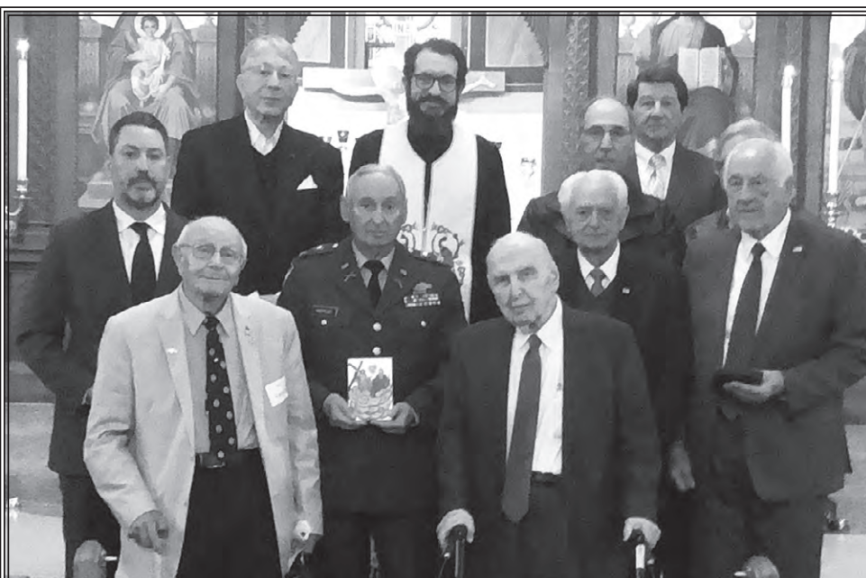
November 10, 2019: Our community's Veterans are recognized after the Divine Liturgy.

Wishing everyone a joyful Christmas and a Happy, Healthy and Prosperous New Year!