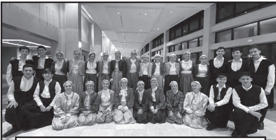
Dance Groups at Hellenic Dance Festival Orlando, Florida