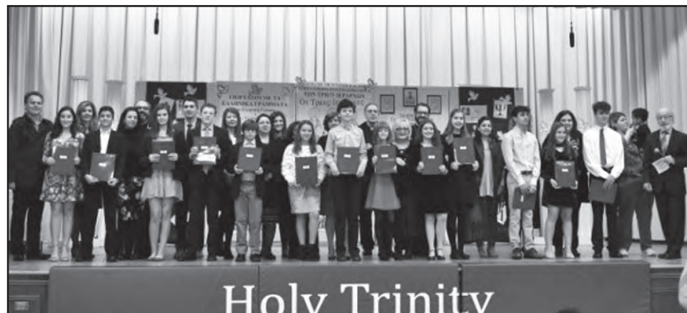
Αναμνηστικό στιγμιότυπο από την απονομή των Πιστοποιητικών Ελληνομάθειας 2019 στους επιτυχόντες μαθητές της ευρύτερης Ελληνοαμερικανικής μας κοινότητας, η οποία πραγματοποιήθηκε στην αίθουσα «Φαίδων Κωνσταντινίδης» του Καθεδρικού Ναού Αγίας Τριάδας.

Κατά τη διάρκεια της θαυμάσιας αυτής εκδήλωσης απονεμήθηκαν τα Πιστοποιητικά Ελληνομάθειας στους μαθητές που πέτυχαν στις Εξετάσεις Ελληνομάθειας 2019, τιμήθηκαν οι ιερείς μας και οι καταξιωμένοι εκπαιδευτικοί.